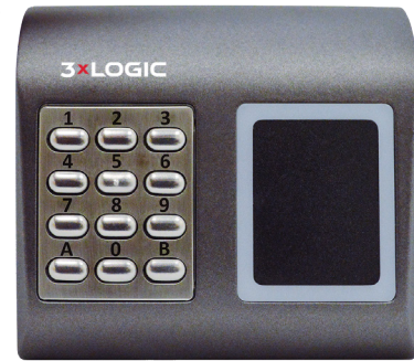
ACTIVE LED STATUS RING