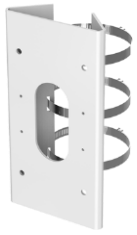
DS-1475ZJ-SUS Vertical Pole Mount