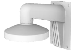
DS-1473ZJ-155 Wall Mount