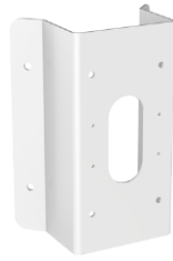
DS-1476ZJ-SUS Corner Mount