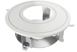
DS-1227ZJ-DM42 In-Ceiling Mount