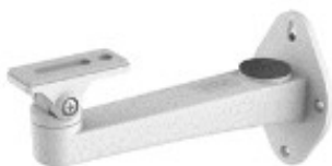
WBL Wall Mount (included)