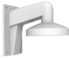
DS-1473ZJ-155-Y Pendant Mount