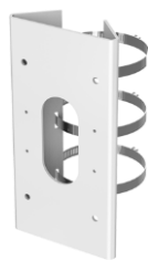
DS-1475ZJ-SUS Vertical Pole Mount