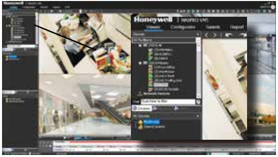
MAXPRO VMS Client Viewer 2x2

Control of MAXPRO VMS can be through a traditional joystick controller, mouse or even through third party interface. The extremely powerful rules engine (Macro's) allows customization of the system to respond and control in the best possible manner for the application.