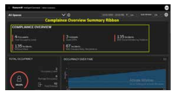
MAXPRO intelligent Command

With MAXPRO VMS R670 a new Intelligent Command Web Client is introduced, offering intuitive map navigation across sites, buildings and floors, and camera live view pop-up, instant playback and alarm indication on maps, as well as bulk camera firmware and password updates, a new System Health Dashboard for Video Devices such as Recorders and Cameras which enables customers to obtain situational awareness and manage their facility efficiently. A new Safety Compliance Dashboard for Healthy Buildings KPI's provides ability to view compliance and incidents from a single view.