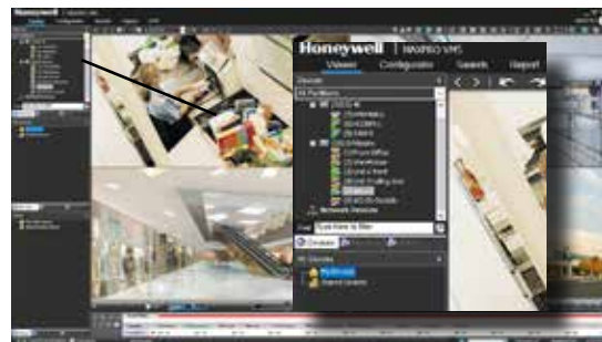
MAXPRO VMS Client Viewer 2x2

MAXPRO VMS is ideal for facilities requiring at-risk critical infrastructure protection such as airports, seaports, large multi-site commercial buildings, casinos, and other high-profile facilities. It is the perfect client-server video management solution for locations requiring the use of both digital and analog technologies.