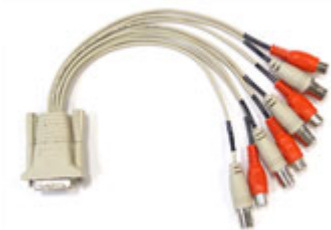
4 cam video cable