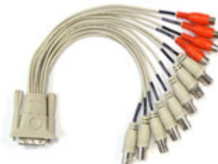
8 cam video cable