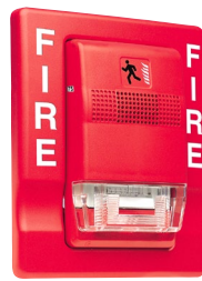
Genesis Chime-strobe with optional trim plate

Genesis chimes and strobes mount to any standard one-gang surface or flush electrical box. Matching optional trim plates are used to cover oversized openings and can accommodate one-gang, two-gang, four-inch square, or octagonal boxes, and European 100 mm square.