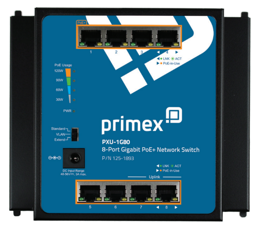
PXU-1G80 8-port PoE+ shown