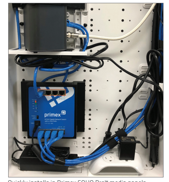
Quickly installs in Primex SOHO Pro™ media panels.

FOR MORE INFORMATION CONTACT: 1.604.881.7875 1.604.881.7835 www.primex.com