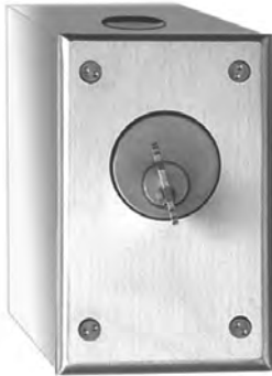
CM-1000 Shown with mortise cylinder (sold separately)