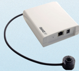
HS Series Features a Full HD Pinhole IP Camera (3.7mm - ZN1-V4FN4 or 2.8mm ZN1-V4FN4)