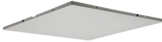
Front View of Speaker