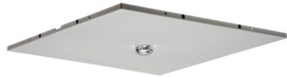
Speaker Strobe shown (as installed and close-up)